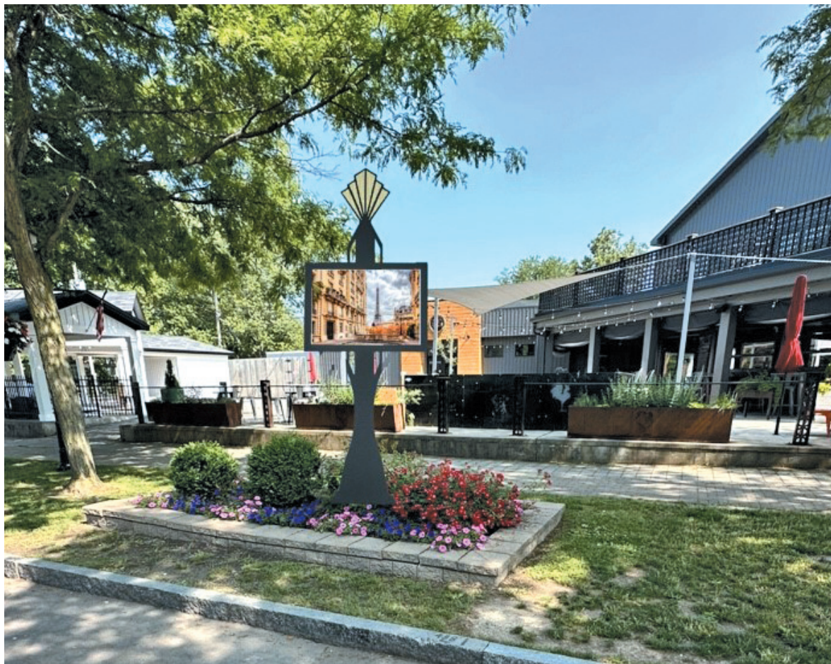
Pictured are Dan Buttery’s renderings of a metal frame and artwork that could be located in the village as part of the “Lewiston Public Art Project.” The frame above is superimposed in front of Gallo Coal Fire Kitchen on Center Street.